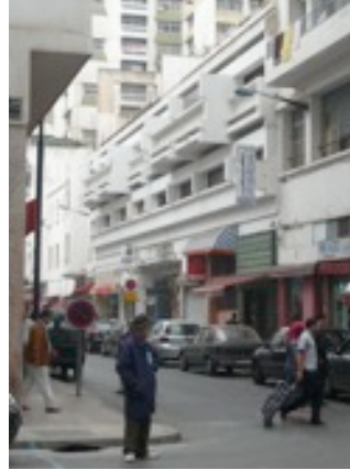
Modern architecture in Rabat

From 18 to 23 November 2009 Luc Verpoest attended as “formateur” the 3rd Mutual Heritage Training Course in Rabat, the capital of Morocco. The Mutual Heritage Project is co-funded by the European Union (EUROMED HERITAGE IV) and focuses on 19th and 20th-century architecture in the Mediterranean area which resulted from the mutual interaction of different cultures. Project partners are: CITERES / Centre Interdisciplinaire Cités, Territoires, Environnement et Sociétés (Université de Tours, France), Casamémoire (Casablanca, Morocco), ENA / Ecole Nationale d’Architecture (Rabat, Morocco), ASM / Association de la Sauvegarde de la Medina (Tunis, Tunisia), Riwaq (Palestinian Territories) and OIKOS (Italy), Patrimoines Partagés (France).