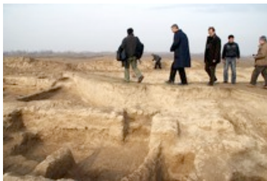
Upper left and upper right Mission to Uzbekistan and Kyrgyzstan, January 2010